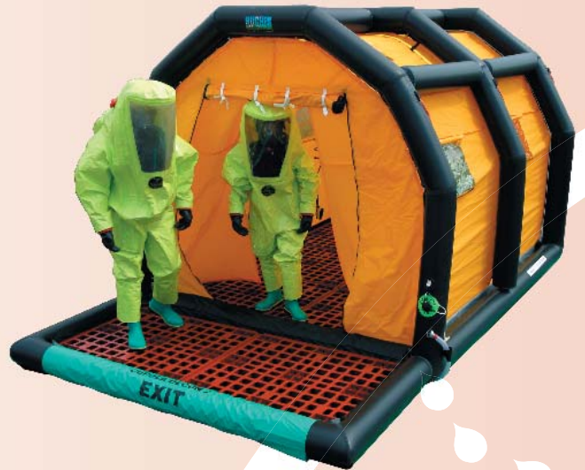
Shown with optional External Sump

The CUPOLAdecon 2 Rapid Decontamination Shelter is the standard unit used by the U.K Fire Service for either decontaminating protective clothing worn by Fire Service personnel, decontaminating equipment or decontaminating members of the public.